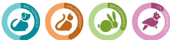
Vets believe that 49% of dogs, 44% cats, 32% small mammals and 11% birds are overweight/obese. LVS November 2016